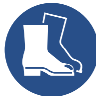
M008 Wear safety footwear