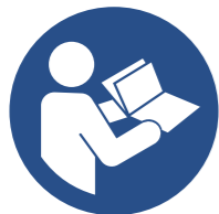
M002 Refer to instructions manual

This operations manual describes general inspections, servicing and operation with the normal safety precautions required for normal servicing and operating conditions. It is not a guide, however, for abnormal conditions or situations, and therefore, service personnel and operators must be safety conscious and alert to recognise potential servicing or operating safety hazards at all times, and take necessary precautions to assure safe servicing and operation of the equipment.