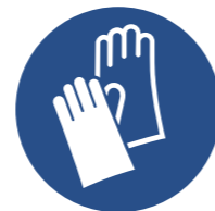
M009 Wear protective gloves