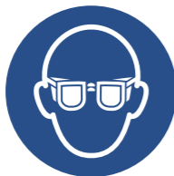
M004 Wear eye protection