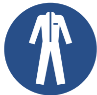
M010 Wear protective clothing