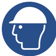
M014 Wear head protection