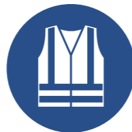
M015 Wear high-visibility clothing